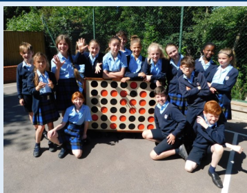
Year 6s with their Leavers' gift for the school - a Giant Connect 4 game!